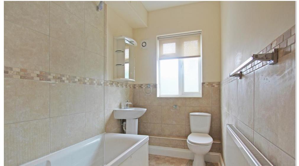
9 WILLIAM HOUSE 82 NORTH CRAY ROAD BEXLEY DA5 3NA Price: £1,575.00 p.c.m.